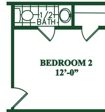
OPT. 1/2 BATH

14'x56' (60' OVERALL) APPROX. 765.00 SQ. FT. 2 BEDROOMS, 1 BATHS