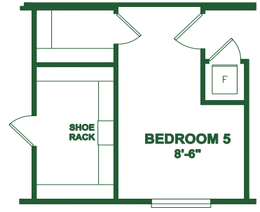
BEDROOM 5 OPTION

MODEL: 3380 32'x76' (80' OVERALL) APPROX. 2,356 SQ. FT. 4 BEDROOMS, 2 BATHS